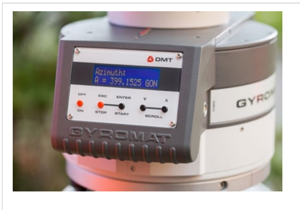
GYROMAT 5000 Display