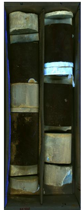
DMT CoreScan UV in operation