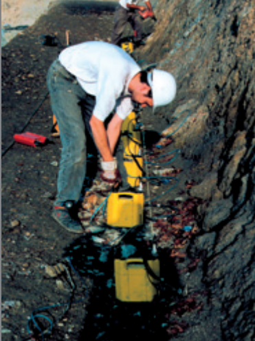
Photo right: 3D-Laserscanning – latest measuring technique to take the inventories with highest precision: shaft-landing

Photo left: Seismic exploration for high resolution investigation of deposits