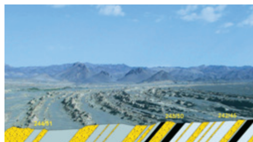
Knowing the underground is a vital basis for planning and assessment

As a result of new safety aspects and rules geomonitoring is becoming increasingly significant, not only in connection with immission control but also with early warning and alarm systems. For example, we use vibration measurements as well as geodetic and geotechnical monitoring to detect and predict at an early stage changes in the bedrock and at the surface.