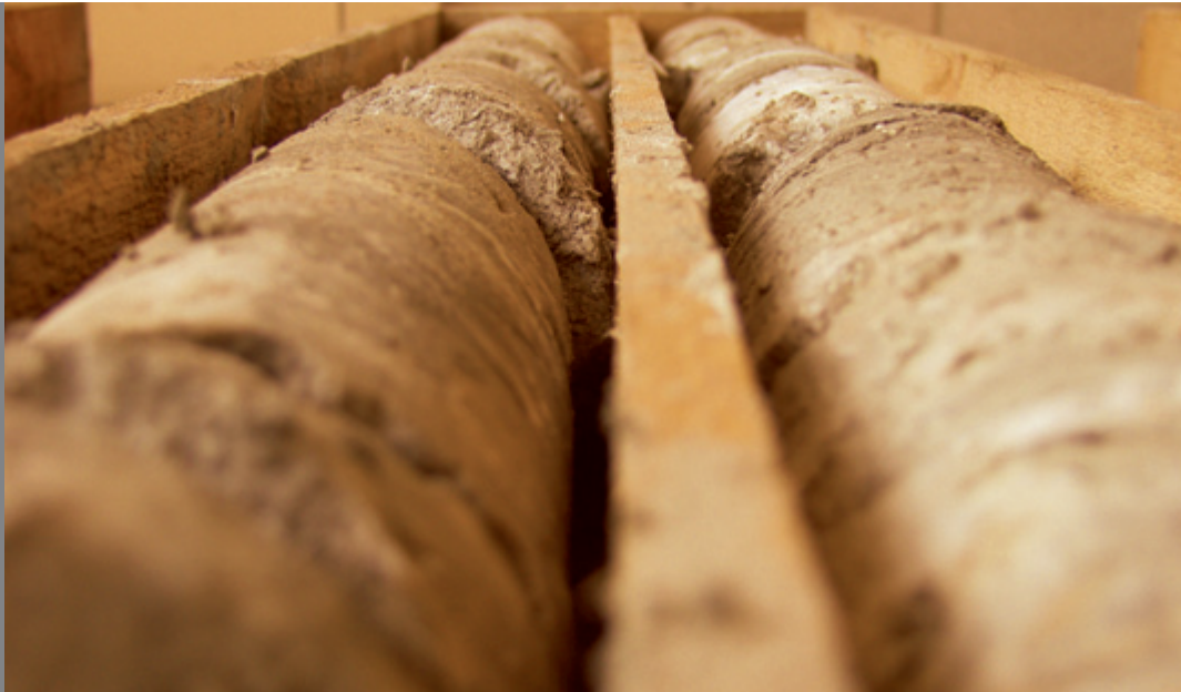
Drill core evaluation – one step to get a comprehensive model of mineral deposits

Where are mineral deposits located? How big are they and what quality do they have? And under what conditions can they be economically recovered? Not easy questions to answer, but providing answers to these and many other related questions is precisely our speciality. For more than 100 years in the exploration of natural resources we have been investing our time, effort and expertise to get the best results out of every project we undertake. And with quite some success. We are now one of the world's leading providers of exploration services and instruments. Take advantage of our know-how and get to the bottom of things.