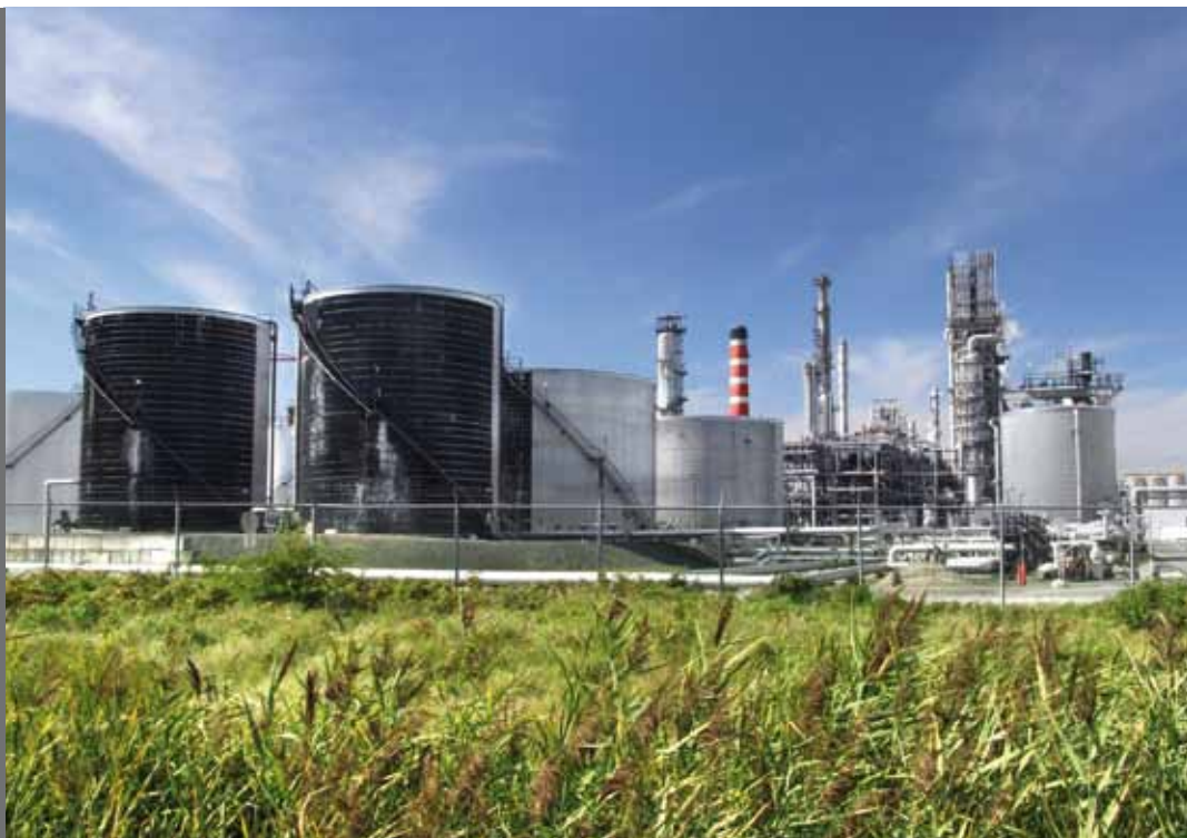
Major oil refinery

Additional costs and effort are always the consequence of unexpected technical failures. In the interest of avoiding events like this, DMT has developed a special maintenance tool oriented strictly on long-term benefits and operational needs.