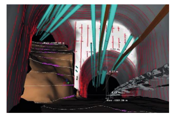
As-built documentation of underground roadway