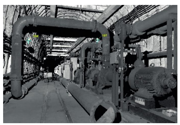
Point cloud of a pumping station in an undergroundcoal mine