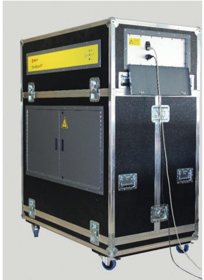
DMT CoreScan UV in operation