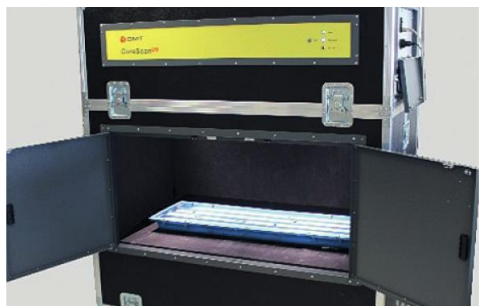
DMT CoreScan UV in operation