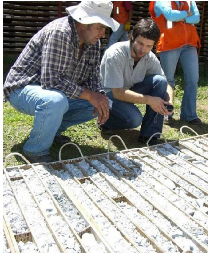
Heavily broken cores to scan and analyse