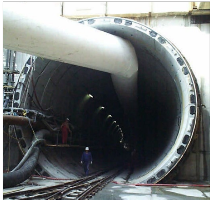
Application in tunneling