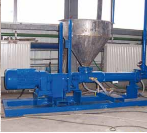
Pump for DMT's DN 40 pipeline viscosimeter measuring system